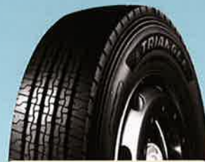
TR685 10R22.5 | 235/75R17.5 205/75R17.5 | 245/70R19.5 215/75R17.5 | 315/70R22.5 225/70R19.5