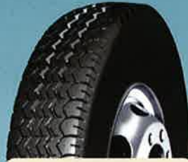
Bel 25 10.00R20