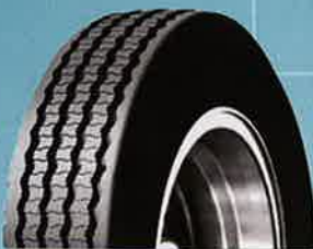
TR665 315/80R22.5 9R22.5