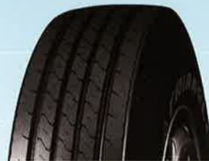
TR695 10R22.5 11R22.5 12R22.5 13R22.5