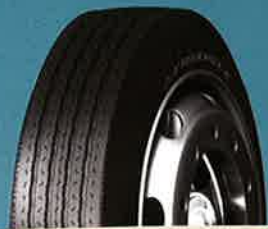
TR656 255/70R22.5 | 8.5R17.5 275/70R22.5 | 8R19.5 9.5R17.5