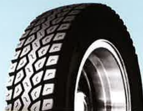
TR689A 215/75R17.5 235/75R17.5