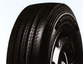
TRS02 295/80R22.5 315/80R22.5