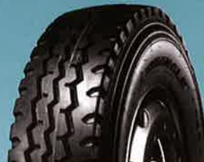
TR668 11R22.5 12R22.5 13R22.5 315/80R22.5