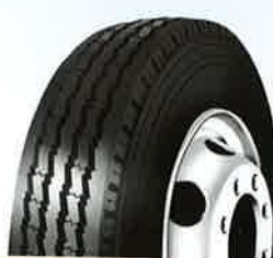
HR169 1000R20 1100R20 11R22.5 900R20