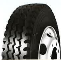
HR168 1000R20 900R20