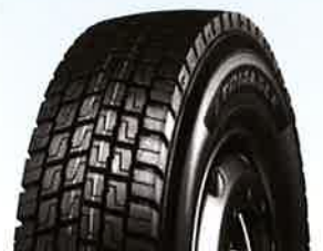
TRD06 295/80R22.5 315/70R22.5 315/80R22.5