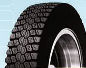
TR688 11R22.5 12R22.5 295/75R22.5 295/80R22.5 315/80R22.5