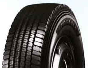
TRD02 295/80R22.5 315/80R22.5