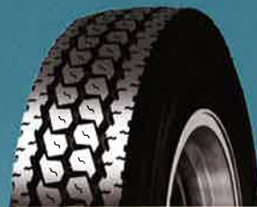
TR657 10R22.5 11R22.5 13R22.5 295/75R22.5