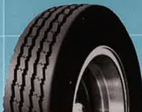
TR666 11R22.5 12R22.5 275/80R22.5 315/80R22.5