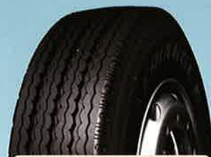
TR686 11R22.5 12R22.5 295/75R22.5 295/80R22.5 315/80R22.5